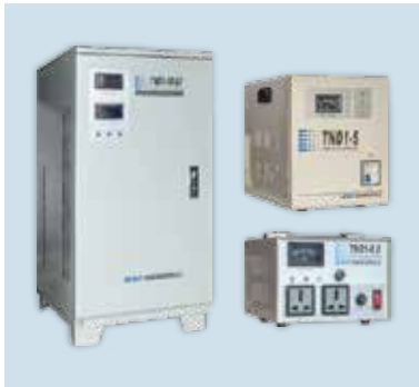
TND1-SVC Single Phase