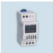
Timers Time Switch