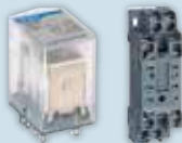
NXJ Plug-in Relay