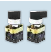
Selector Switch Short Handle Long Handle