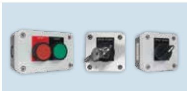
Push Button Box