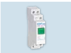
Modular Push Button with Indicator Rated Operational Current 6A, 230VAC