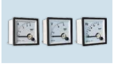
Ammeter, Voltmeter, Frequency Meter, Power Factor, Kilowatt,