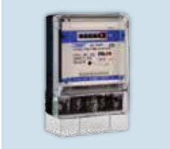
Single Phase Electronic Watt-Hour Meter