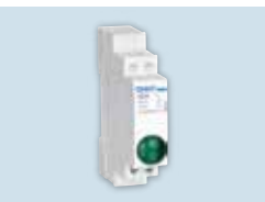
Modular Indicator Light