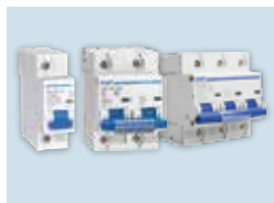
MCB 1P, 2P & 3P Curve C 6KA, 10KA (MCB DZ158-125)