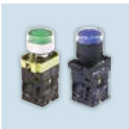
Illuminated Push Button