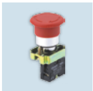
Push Button Mushroom Type