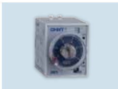
Time Delay Relay AC220VAC