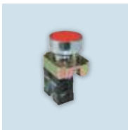
Metal Headed Push Button