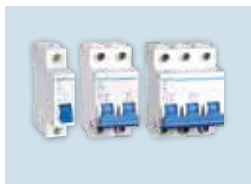
MCB 1P, 2P & 3P Curve C 4.5KA (MCB EB) 6KA (MCB EBG)