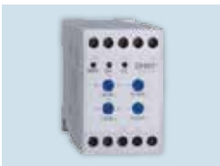
Protection Relay Phase-Failure & Sequence Relay