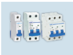
MCB 1P, 2P & 3P Curve C 6KA (MCB NB1-63) 10KA (MCB NB1-63H)