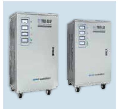
TNS1-SVC Three Phase