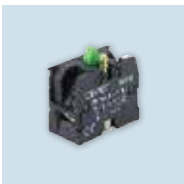
Auxiliary Contact Block Np2 Series