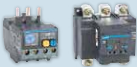
NXR Therna Overload Relay