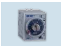
Time Delay Relay AC220VAC