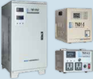
TND1-SVC Single Phase