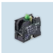
Auxiliary Contact Block Np2 Series