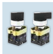
Selector Switch Short Handle Long Handle