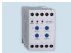
Protection Relay Phase-Failure & Sequence Relay