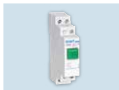
Modular Push Button with Indicator Rated Operational Current 6A, 230VAC