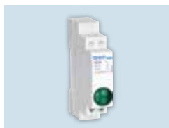
Modular Indicator Light