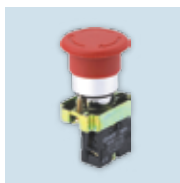
Push Button Mushroom Type