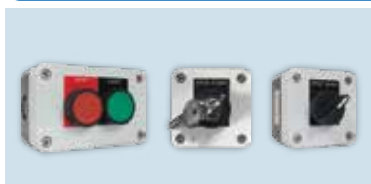
Push Button Box