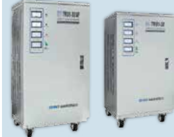
TNS1-SVC Three Phase