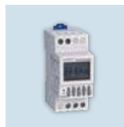
Timers Time Switch