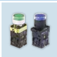
Illuminated Push Button